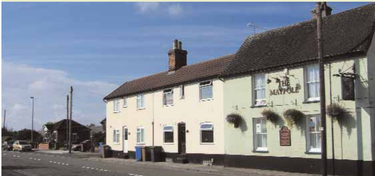
Old Norwich Road

The conservation area designated in March 1990 is bisected by Old Norwich Road. This was formerly a quite narrow road with most properties being set back only slightly from the pavement. It became a very heavily used principal trunk route in the post-war period before being bypassed in the 1980s. It is now a bus priority route with only through local traffic using the narrow Whitton Church Lane. With the removal of heavy traffic, the village street atmosphere has returned to some extent.