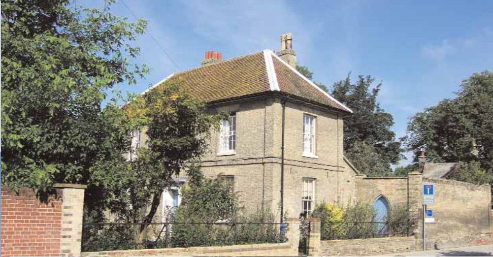
No 785 Corporation Farmhouse Old Norwich Road