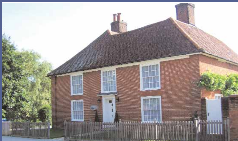
No 728 Street Farmhouse, Old Norwich Road

The large mature tree to the front garden is of crucial importance to the views in both directions within the road, being almost at the halfway point.