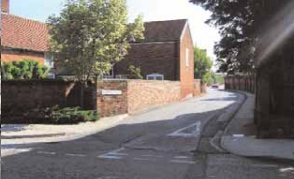
Whitton Church Lane

To the north of Corporation Farmhouse is No.789 'Lilburne Lodge' also a building of special local architectural interest. This small early 19th Century Suffolk white brick house with a central chimney stack, clay plain tile roof and four-light sash windows is a good example of the formal vernacular architecture of the area. The Edwardian porch to the central front door adds a note of distinction to the design. To the north side boundary, Whitton Lane leads to the farm entrance to Corporation Farm. The narrow curving unsurfaced lane emphasises the semi-rural character of the area and this is reinforced by the trees which overhang it (located in the large garden of No.795 on the northern side) and foreshortens the view out of the area.