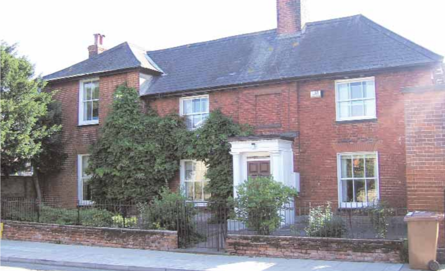
No 726 Fairmead Old Norwich Road

No. 726 'Fairmead' (Listed Grade II) is an attractive early 19th Century red brick, slate roofed two-storey house. A slightly projecting wing with a hipped slate roof was added later in the 19th Century on the northern side. The house has sash windows with glazing bars in gauged arched openings and a central stuccoed Tuscan porch with plain columns projecting on the front. The window opening above is blocked. The tall chimney stack adds to the skyline interest. The front boundary railings are modern with the exception of a small section with the original Victorian cast-iron heads at the corner with the lane. The red brick side boundary wall to Whitton Church Lane, is important in confining the narrow view within the lane to the buildings on either side thereby camouflaging the encroachment of the urban development to the east.