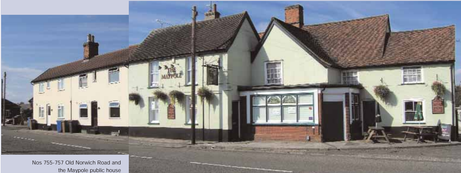
Nos 755-757 Old Norwich Road and the Maypole public house