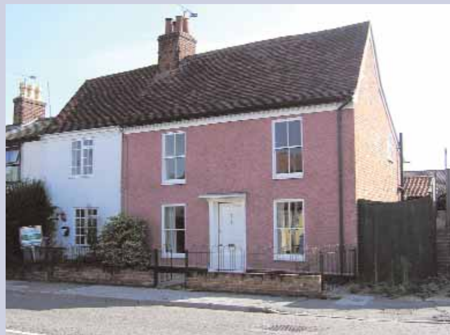
Below: Nos 712-714 Old Norwich Road