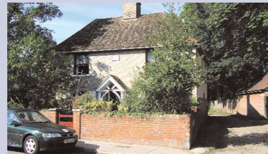
No 786 Lilburne Lodge Old Norwich Road

The front garden planting contributes to the landscape character of the street while also screening to some degree the farm outbuildings to the west. The wall is lower as the corner of the house is approached affording a pleasant oblique view of the front from the street. The rear garden, parallel with the road, is totally secluded behind a very tall, part white brick, part red brick wall. The house also serves to enclose the attractive westward view from the narrow, winding Whitton Church Lane immediately opposite its east elevation.