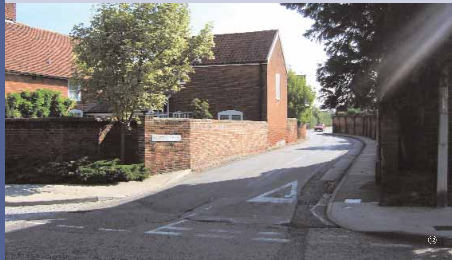
Whitton Church Lane

The area presently lacks any traditional paving surfaces of interest (except the modern slab paving of Whitton Church Lane. The in-situ concrete and tarmac paths have been the subject of frequent ill-matching reinstatement. There are also numerous concrete pavement crossings. Minor environmental enhancement in the form of materials and a change of traffic priorities was carried out at the junction to Whitton Church Lane in 2003.