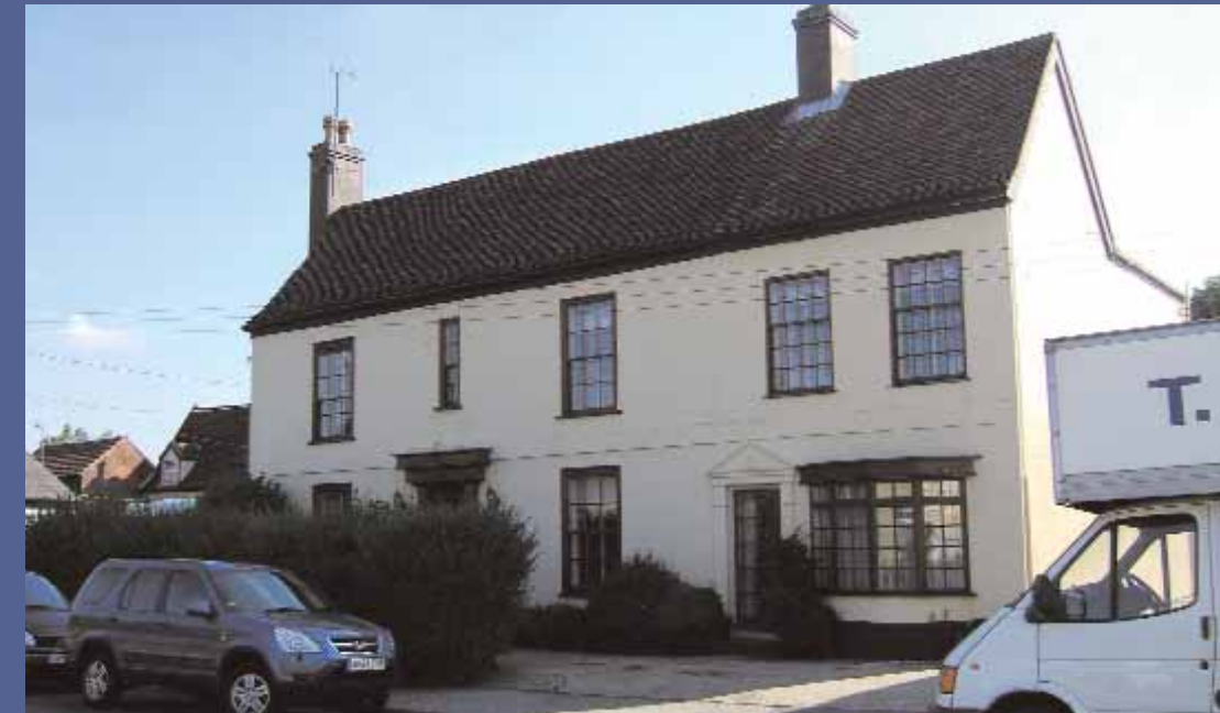
Left: Nos 720 Old Norwich Road