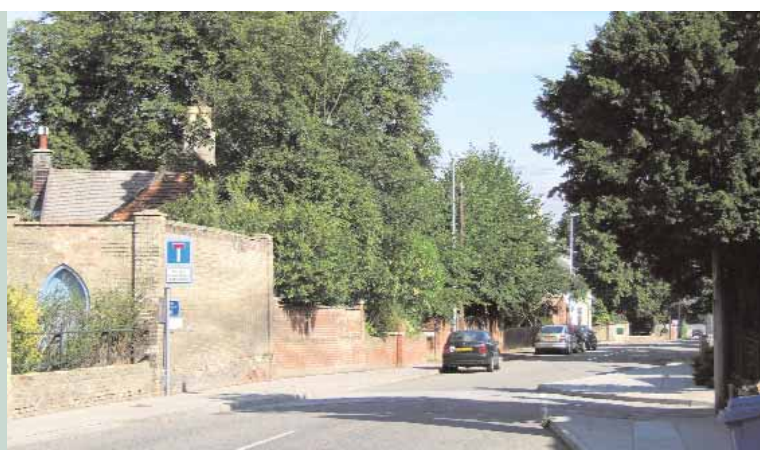
View of Old Norwich Road